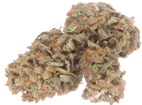
Sample Photo: Hawaiian Haze #C19-HHI-1008-F