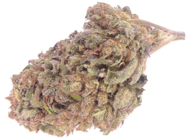
Sample Photo: Special Sauce #C19-SSI-1008-F